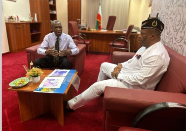
Mr. Efiang Eniang with Senator Ekong Sampson - Chairman, Senate Committee on Solid Minerals Development at the National Assembly, Abuja, recently

He also met with the Federal Minister of Petroleum Resources (Gas), Obong Ekperikpe Ekpo, where they discussed on issues of gas development and renewable energy for Africa.